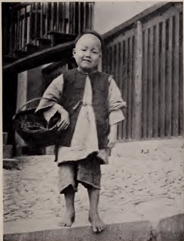
CHINESE BEGGAR BOY.